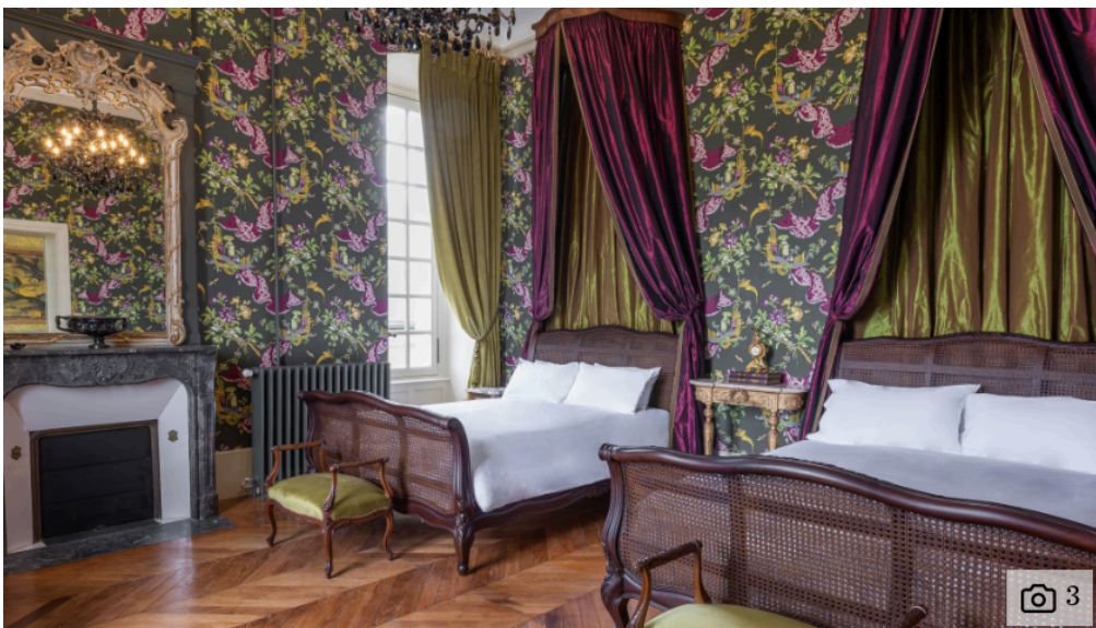
(Hotel Château du Grand-Lucé)

Hotel Château sits proudly on 80 acres in the centre of the village of Grand-Lucé, south-east of Le Mans, surrounded by medieval walls, with just bleached-white gates separating the château from the main village square (although once you're in, you'll feel more than 200 years away).