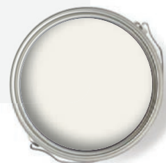
WHITE DOVE Benjamin Moore