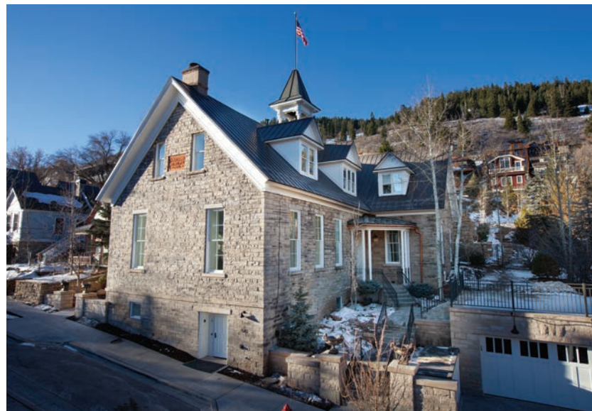
One of Park City's historic landmarks, the Washington School House was built in 1889 and is just steps above bustling Main Street.

30 Use glass objects to lighten a display. Crystal pitchers and glassware provide interest and sparkle to the built-in shelves without adding bulk or visual weight. USD